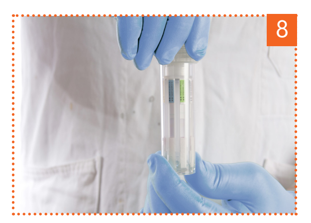
Screw the top of the strip tube.

You must hear two separate clicks, for perforation of superior and inferior septa of the sample tube.