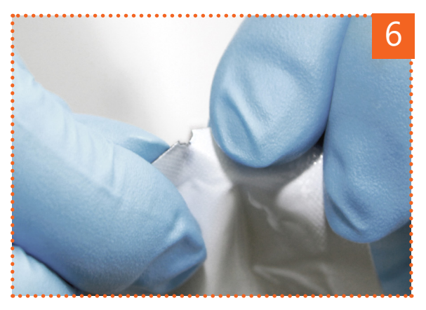
■ Tear the aluminium envelope open at the notch. Once the device has been taken out of the envelope its stability is of short duration, especially in a humid environment.