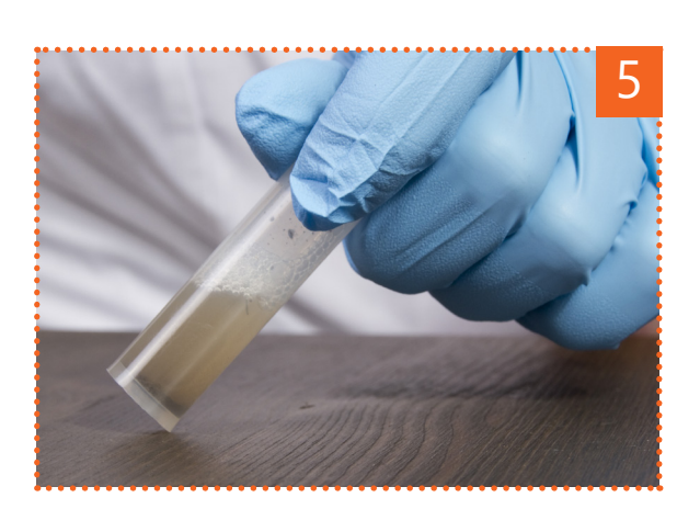
■ Tap the sample tube on a hard surface so that all the liquid is collected at the bottom of the tube.