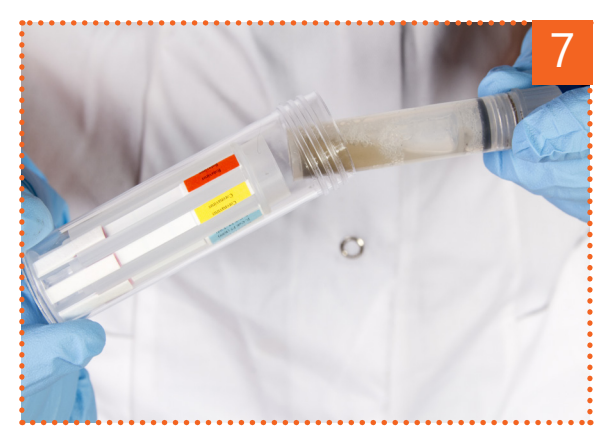
■ Insert the sample tube into the strip tube.