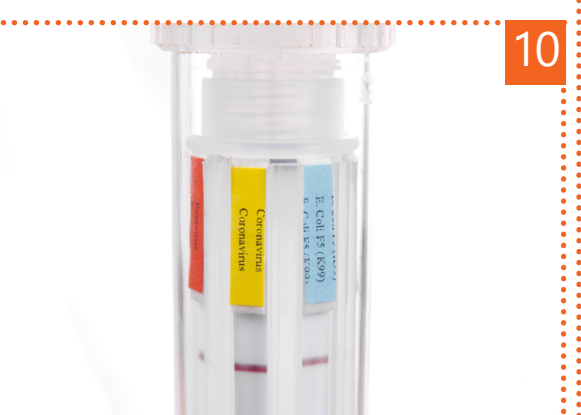
After 10 minutes, read the results using picture 11 as standard.

The liquid contained in the sample tube moves to the strip tube and slowly migrates along the strips.