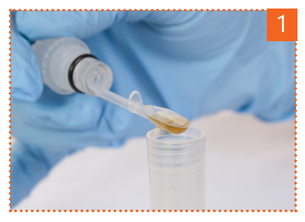
■ Take the faeces directly from the rectum of the calf. If the samples are liquid, take a spoonful.